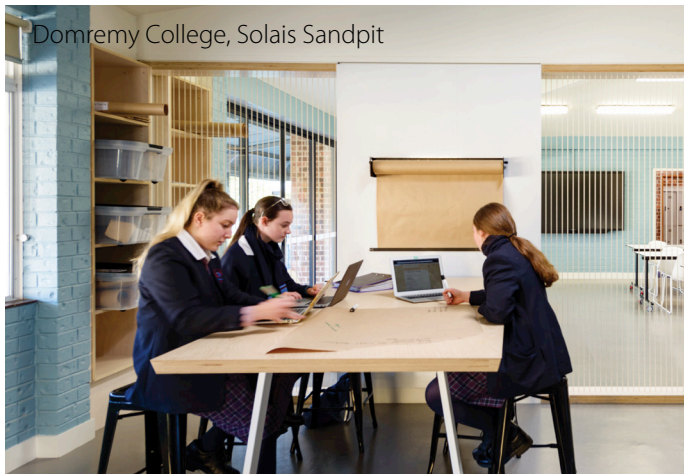
Domremy College, Solais Sandpit