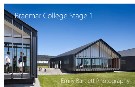
Braemar College Stage 1

This project is an example of what can be achieved with the successful integration of educational pedagogies, community values and architectural design philosophies. The concepts around integration with the community, which were identified as a key design driver during the briefing stages of the project, are commendable; with the underpinning foundation of the design to allow for the 'Staff and City working together to ensure the village raises a child'. The project appears to achieve this goal by providing a community hub which utilises a shared-use model between school and