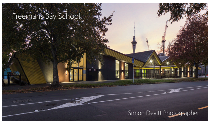
Freemans Bay School

The building lends itself to creating a new typology where science and learning exist together and are on display to inspire and educate all who encounter it.