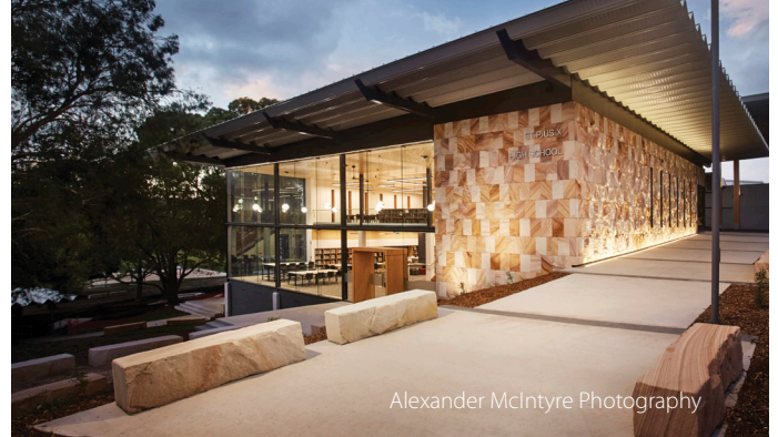
St Pius X High School – Library, NSW

The extensive use of timber and the exposed comprehensively detailed structure of the building give it material warmth and create opportunities for children to learn about the mechanics of the building. The outcome is a truly beautiful aesthetic with