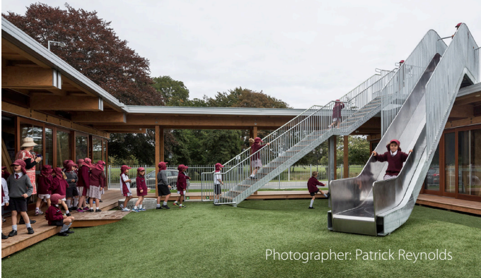
Cathedral Grammar Junior School, Christchurch